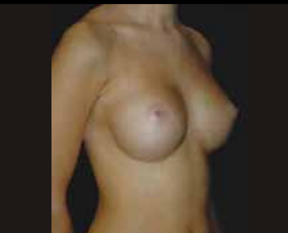
AFTER breast augmentation by Dr Tavakoli (27 year old female, nil 5'8", pregnancies, 350g anatomical Brazilian P-URE implant, full C cup)